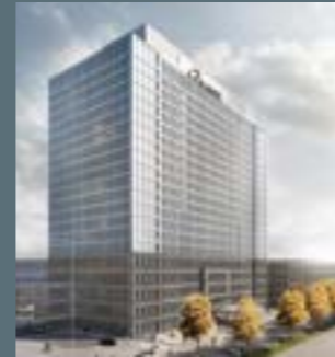
Think Campus Potsdam